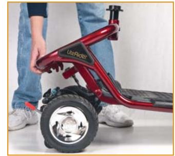
While squeezing the release lever, pull up on the rear frame