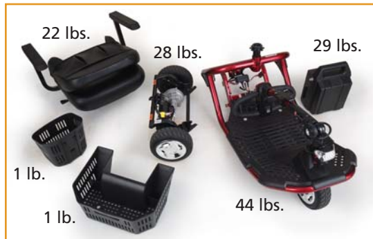
Disassembles into six pieces for transport and storage! No wires to connect or disconnect!