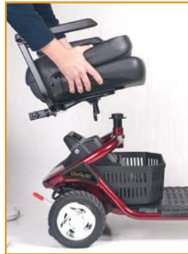
Pick up the seat