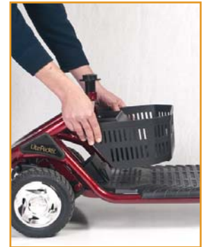
Remove the baskets from under the seat and from the tiller (not shown)