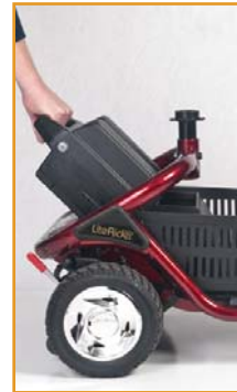
Pull out the battery pack